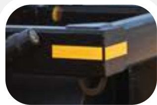
Steel Reinforced Corners