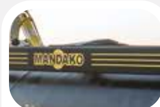
8" x 4" x 3/8" Frame Tubing