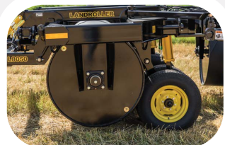
42" Diameter x 0.625" Drum Wall