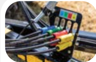
Colour-Coded Hydraulic Handles