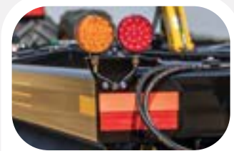
LED Light Kit (ASABE Compliant)