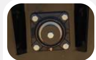
3" HD Drum Shaft/Bearing